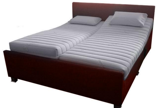
The Geelong - Electric Adjustable Bed