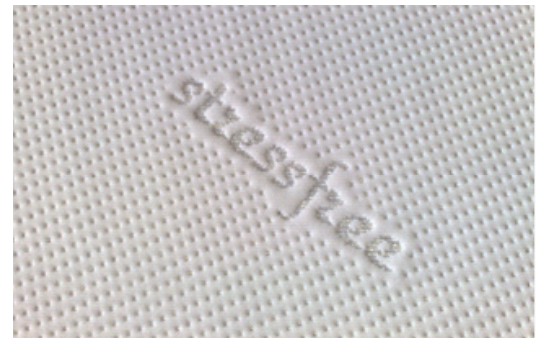
Silver Thread Removable Cover