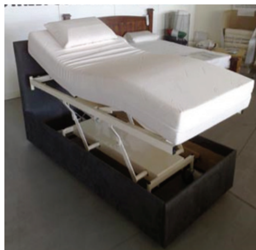
The Lift Bed.